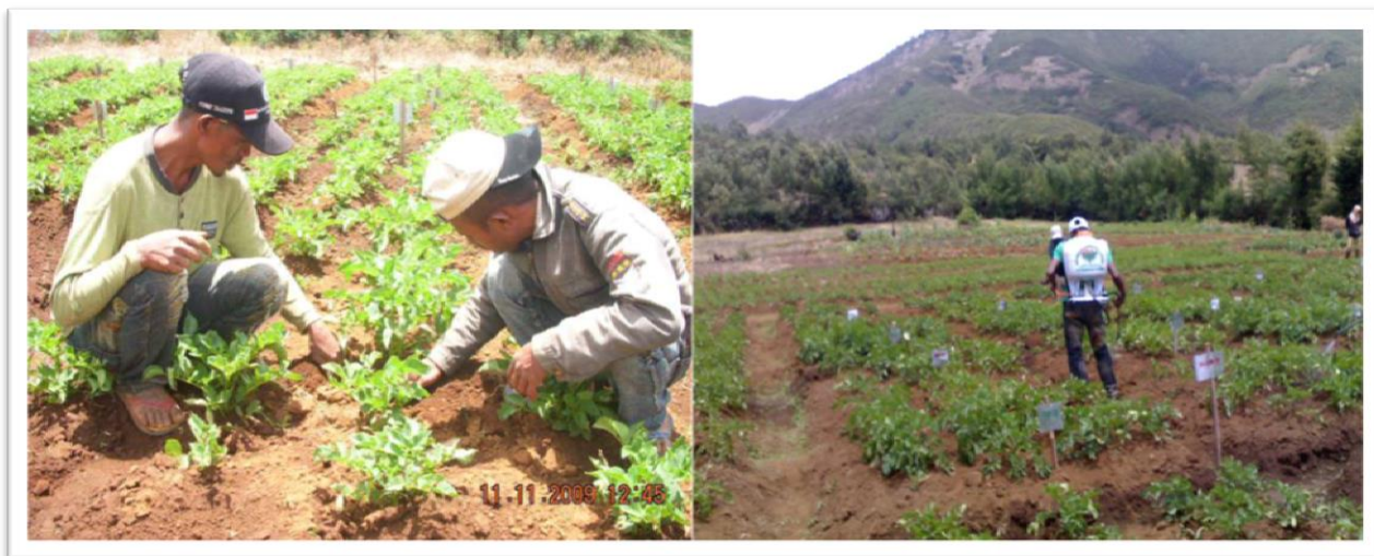
Figure 2: disease observation and spraying of fungicides