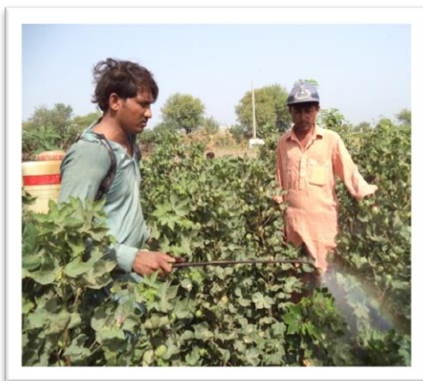
FFS farmer spraying 2% urea with micronutrients on cotton

FFS farmers experimented to test the hypothesis of managing the CLCuV by applying foliar spray of urea and micronutrients. Best dose of Urea (2%) with micronutrient solution was applied with five days interval on cotton crop in different FFS at District Bahawalpur, Khanewal and Vehari in minimum one acre area after CLCuV symptoms were visible. Since last three years, they are practicing this method.