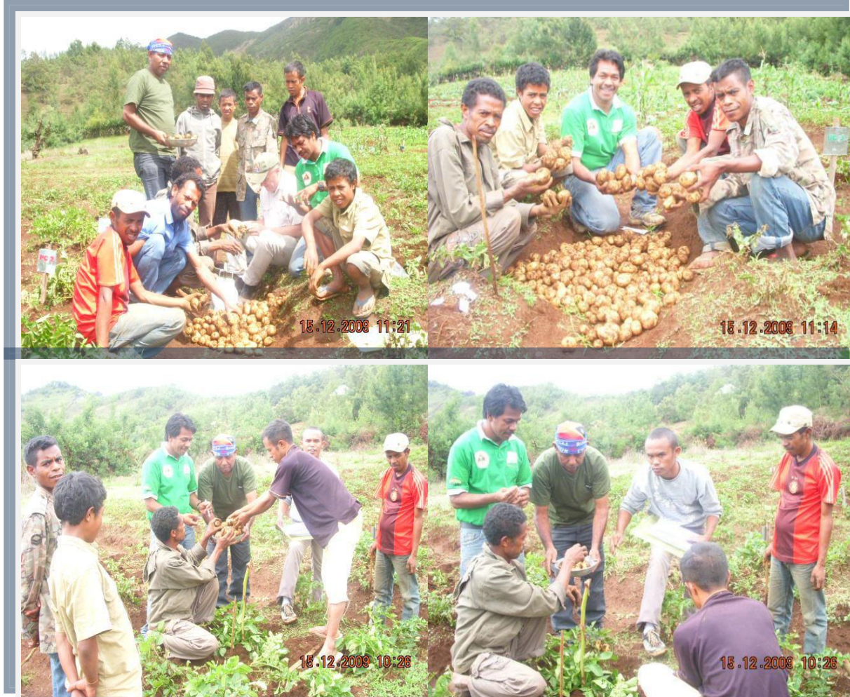
Figure 3. Farmer happy face at harvesting