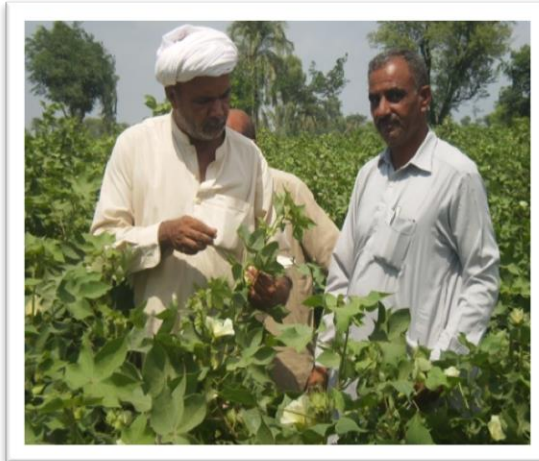
FFS farmers are observing their cotton crop for CLCuV