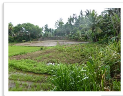
Surroundings full of weeds

The leader of the farmer organization of the village invited us to help them in management of rice field rats which they struggle for last 5-6 years. When we conducted a baseline survey of the area, we came to know that around 30% - 80% of the crop yield has been damaged by rats depending on locations. The area is a valley in between two mountains which has been converted to rice fields, and therefore the surroundings provide favorable environment for rats to living and multiplication. Fields are constructed with small terraces and many bunds, due to the high slope of the land. Bunds covered with full of weeds providing favorable environment for rats.