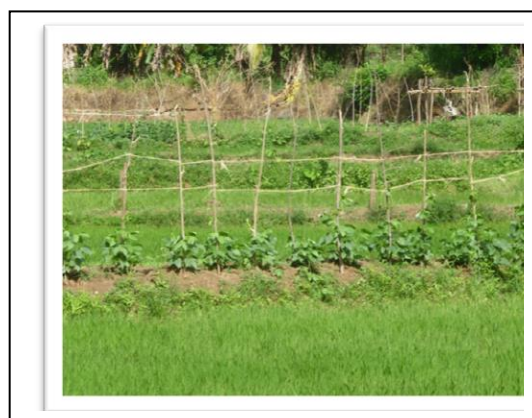
long bean cultivation on bunds

Session 5 – Introduction of chemical control.(rodenticides) and placed rodenticides where necessary.