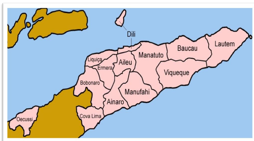
Figure 1. Map of Timor Leste

Potato is also one of important source of income for people who live in the hilly areas of Timor Leste such as Ainaro and Aileu districts. Potato has been cultivated during Portuguese occupation until today, and the production is not increase due to attack of late blight of potato. This fungus attack during growing season when the condition is favorable for disease development, and at the early January, the fungus is more due to high rainfall rate.