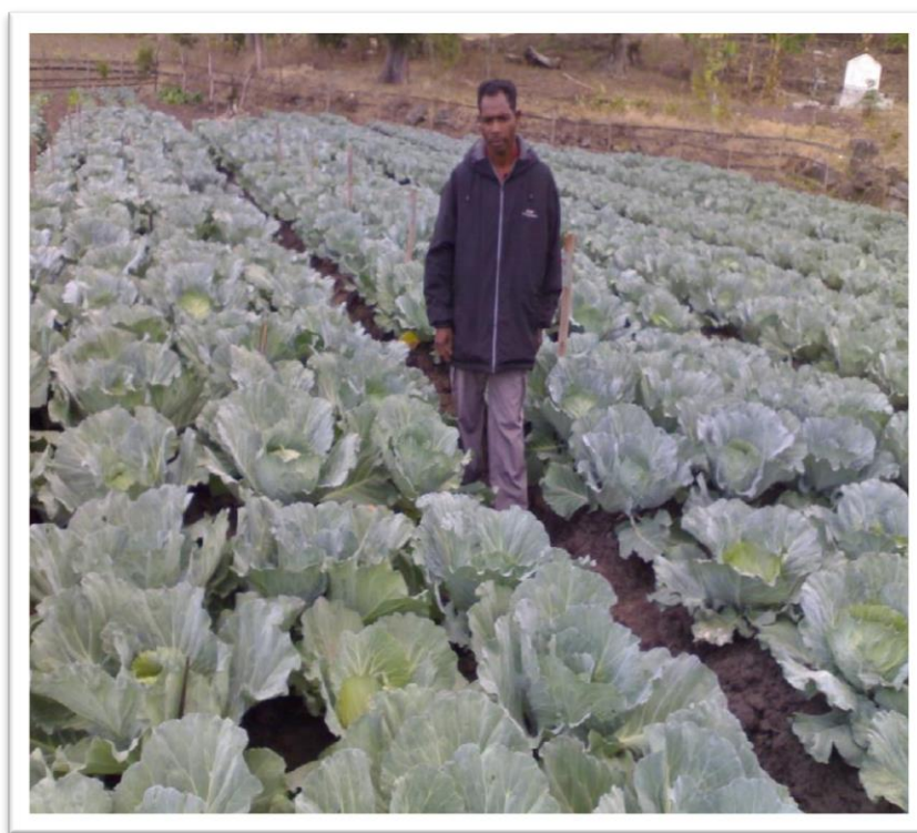
Figure 1. Farmer with his demonstration plot

At the harvesting time, we count the cabbage's weight, calculated the percentage of damage and compare different treatments. The result show that chemical control using of inorganic insecticides has less weight compare to biological insecticides, and control or use of sanitation only also provide same weight, but the damage percentage is high on control.