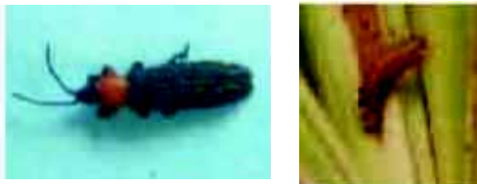
Figure 2: Adult (left) and larva (right) of P. reichei

No studies have been conducted on life cycle and other aspects the biology of this pest in Sri Lanka. However, literature shows that lifespan of the adult is about six to eight months. Head and thorax of the pest are brownish orange in colour while the abdomen is black. Males (about 6.5 mm long) are comparatively smaller than females (about 7.5 mm).