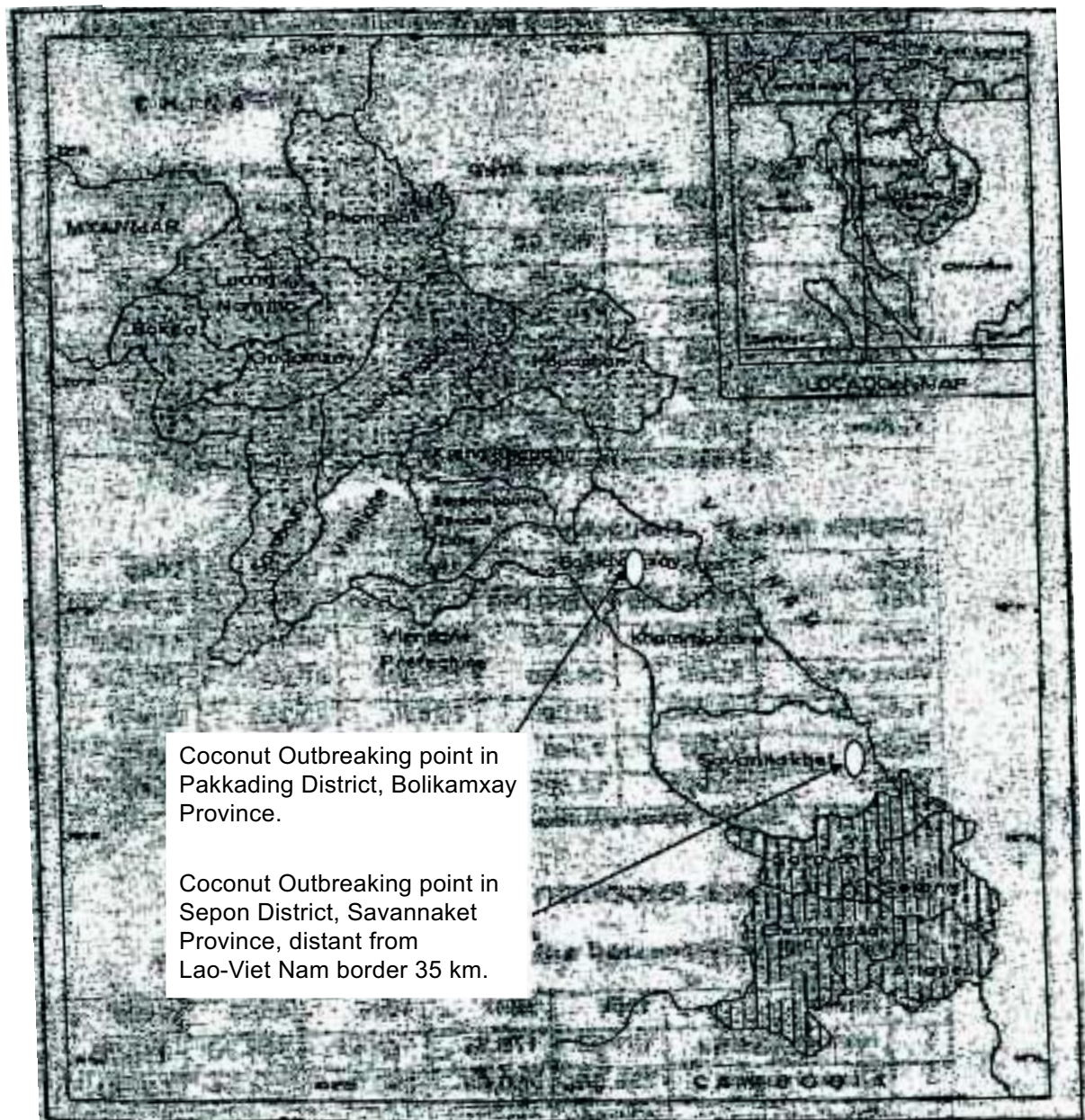
Figure 1: Sites of Brontispa longissima outbreak in Lao PDR

The losses due to coconut beetle outbreak in Lao PDR have not been estimated so far because of traditionally scattered nature of cultivation. However, it appears that coconut palms in Savannaket province have serious infestation. Therefore, close-by areas in Salavan, Champasack, Khammoun provinces and Vientiane capital are at high risk (Figure 2).