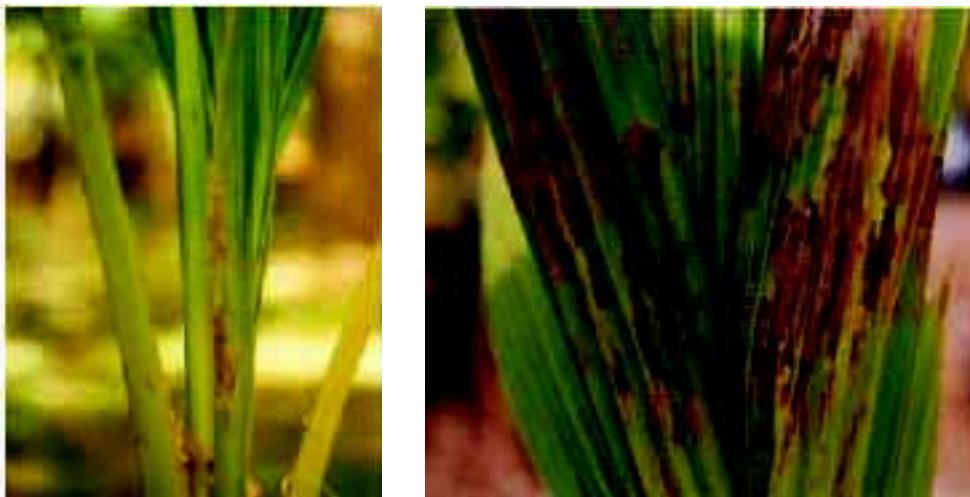
Figure 1: Damaged shoot (left) Damaged leaves of a seedling (right)

Both adults and larvae damage the leaflets of young unopened fronds by feeding on tissues. The symptoms are prominent when the affected leaves become unfolded and green. Small brown patches of varying sizes and light brown streaks, which are typically parallel to the midrib could be observed in the opened green leaflets. The brown areas shrivel and curl, giving the leaf a characteristic scorched, ragged appearance.